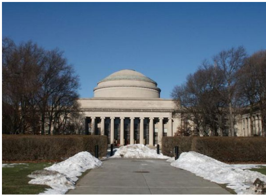
Figure 1. With caption below, be sure to have a good resolution image (see section 5.1 for image preparation instructions).

On pages beyond the first, start at the top of the page and continue in double-column format. The two columns on the last page should be as close as possible to equal length.